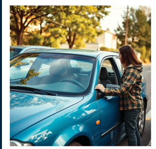
Vehicle Payments, Car Services, Car Insurance