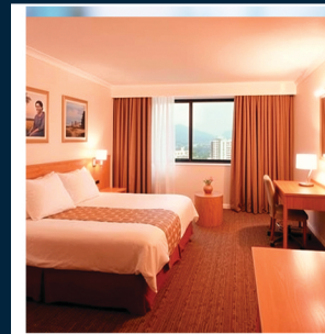
Hotels (as needed)