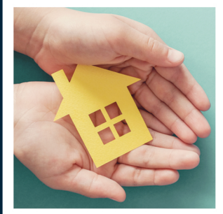
Mortgage or Rent, Emergency Housing