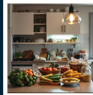
Food, Utilities, Gas