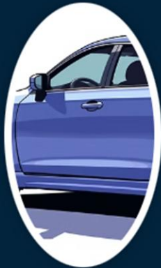
Transportation as Required, Insurance