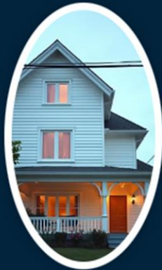
Emergency Housing, Rent/Mortgage, Hotels as Needed

COMMUNITY EVENTS will also be held to foster a family feel in Schuylkill County.