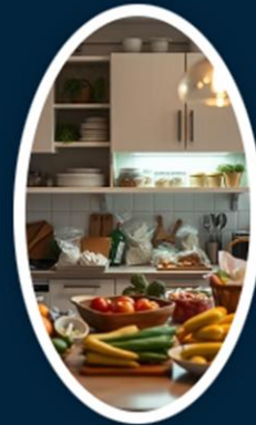
Food, Gas, Utilities